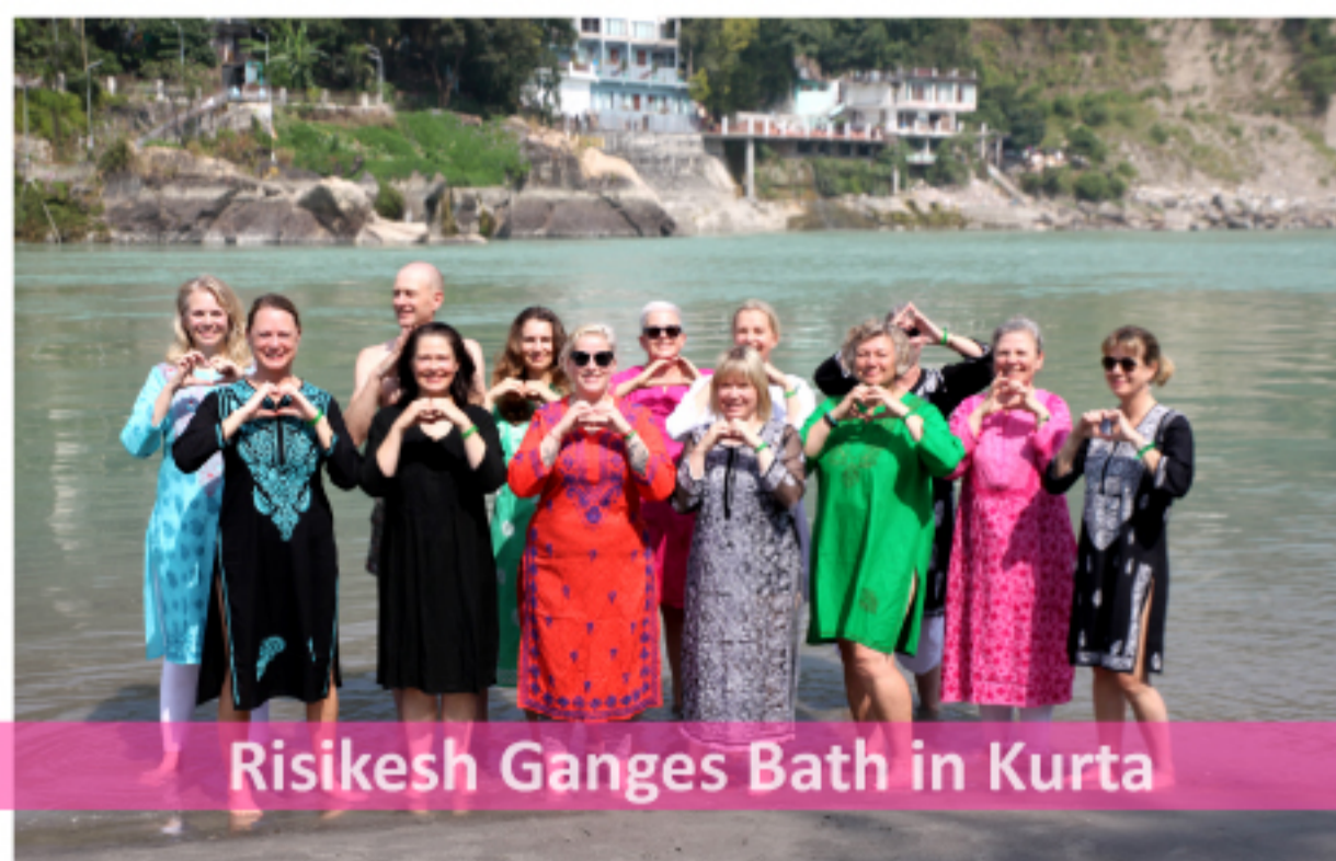
Risikesh Ganges Bath in Kurta