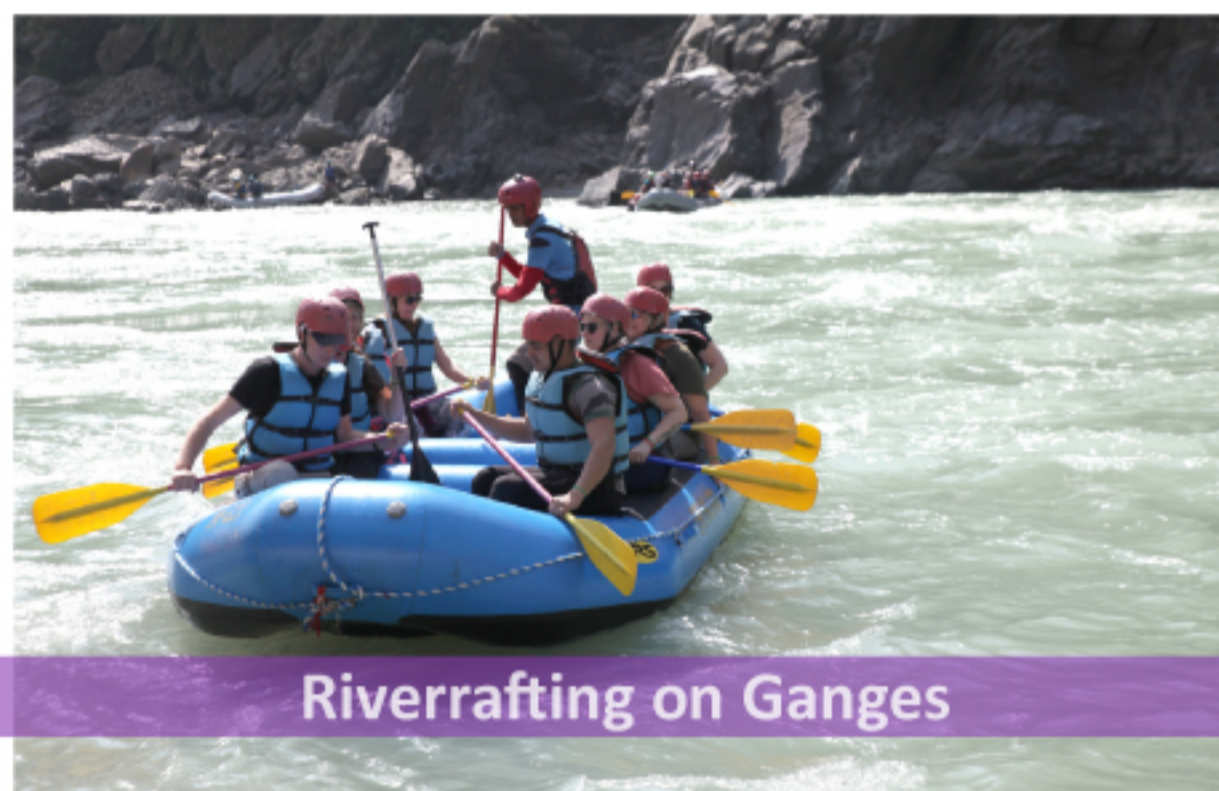
Riverrafting on Ganges