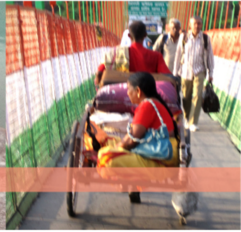
Risikesh – The Capital of Yoga