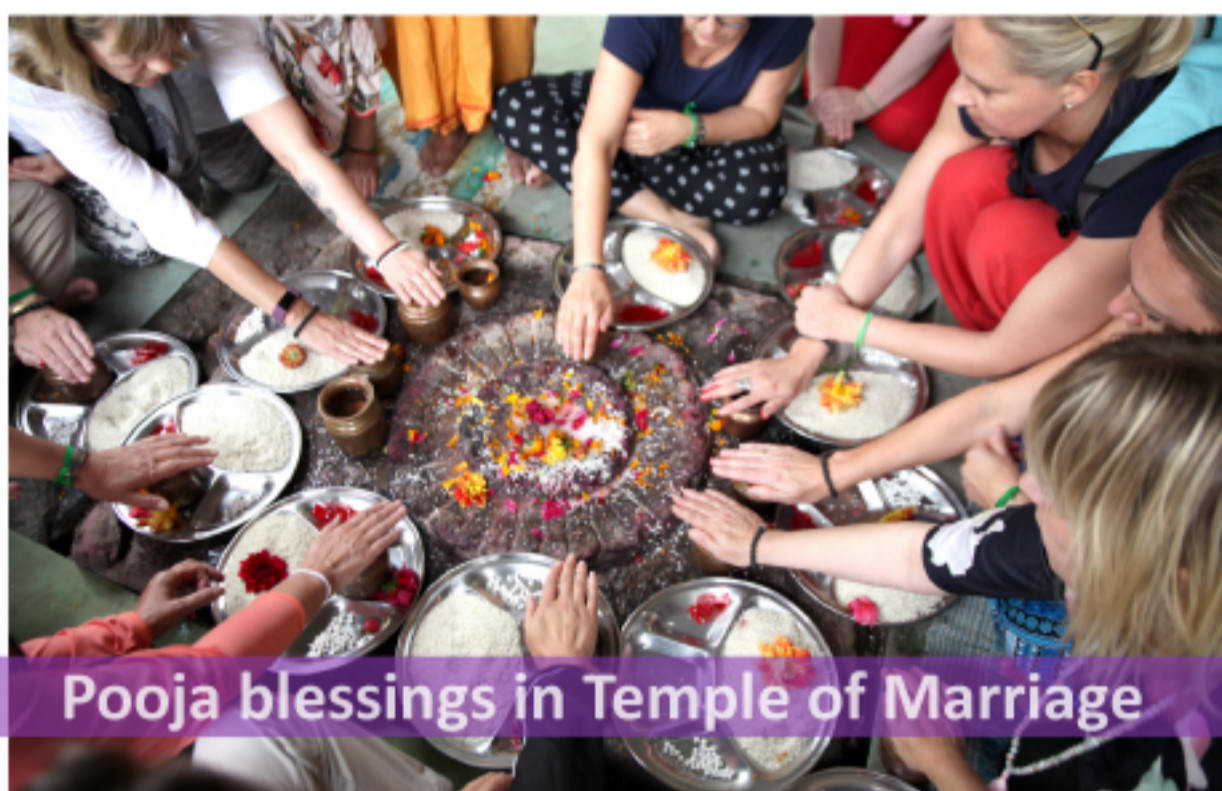
Pooja blessings in Temple of Marriage