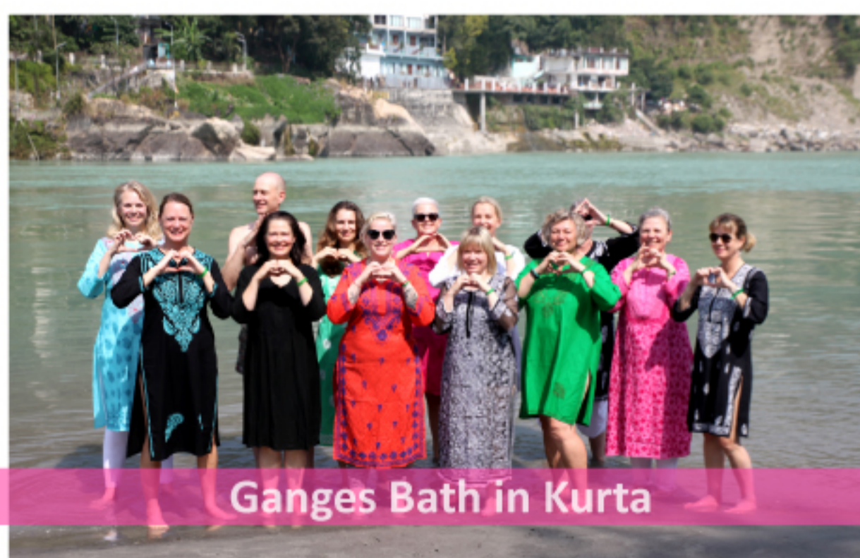
Ganges Bath in Kurta