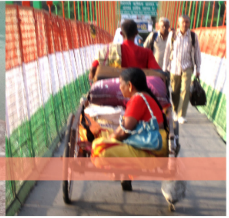
Risikesh – The Capital of Yoga