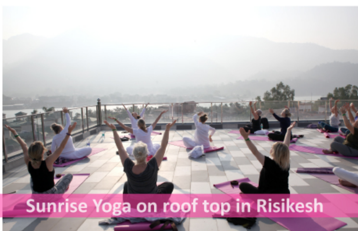
Sunrise Yoga on roof top in Risikesh